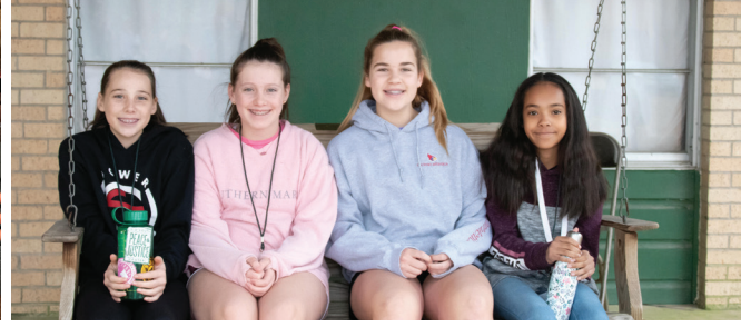
Photos from Latte With the Ladies, JYF (grades 3-5) Midwinter and Chi-Rho (grades 6-8) Midwinter.

Meaningful fellowship, learning and spiritual development opportunities are available for all seasons of life at UCC. We offer an array of ways for you to grow and connect: Bible studies, book clubs, retreats, workshops and small groups.