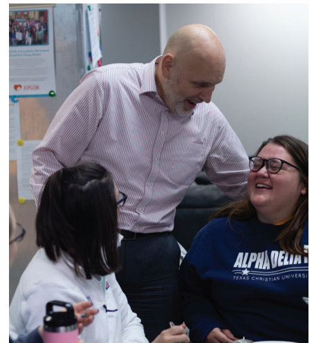
Photos from Disciples Class, UCC Softball, Sunday Worship and College Lunch Bunch.