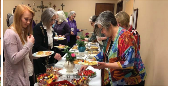
Photos from Welcome to Worship, Agape Feast and Clergy's Women Breakfast.

Part of discipleship is responding to the needs of others. From around the world to our local community, we are being called to serve. We offer many outreach opportunities to live out this call.