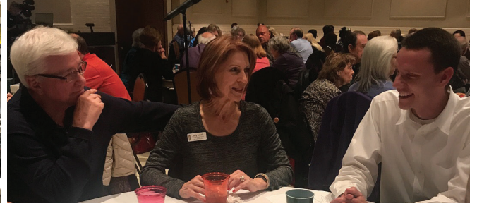
Photos from Third Grade Bible Presentation, Cinnamon Roll Sunday Preparation and Connect Dinner.

Meaningful fellowship, learning and spiritual development opportunities are available for all seasons of life at UCC. We offer an array of ways for you to grow and connect: Bible studies, book clubs, retreats, workshops and small groups.