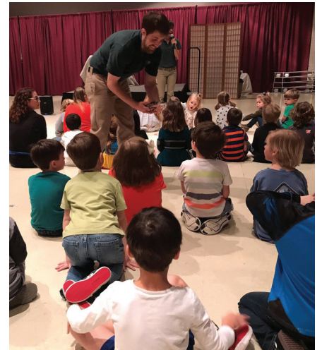
Photos from Third Grade Bible Presentation, Walk to End Alzheimer's, Faithful Families, Youth Game Night and WDS Zoo Visit.