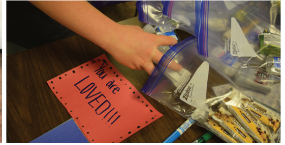
Photos from JYF Bible Bowl, Faithful Families and Youth Service Night.

Part of discipleship is responding to the needs of others. From around the world to our local community, we are being called to serve. We offer many outreach opportunities to live out this call.