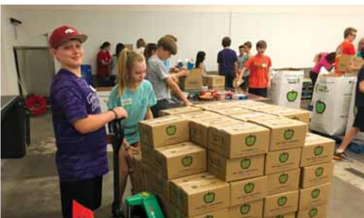
Chi Rho Mission Trip