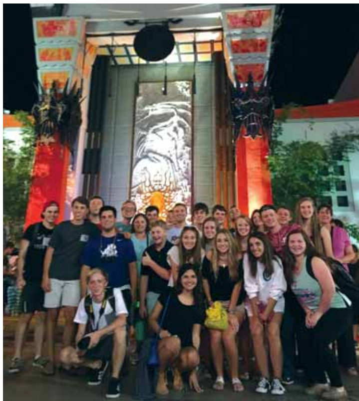
CYF Mission Trip

Each year, the Chi Rho and CYF youth each go on a mission trip to a different city where they partner with different organizations to complete service-learning and get to know the city through different excursions. This year, the Chi Rho (grades 6-8) will be traveling to Austin, Texas, from June 4-7, and the CYF (grades 9-12) will travel to Memphis, Tennessee, from July 2-9. Both trips will allow youth to bond with their UCC community while getting to know new people and new places as they see and partner with what God is up to in other cities.