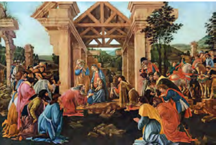
"Adoration of the Magi"