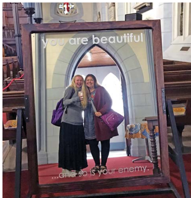
You are beautiful and so is your enemy. Our pilgrimage centered on inner spiritual growth which created ample time to challenge ourselves and meditate on new and difficult ideas.