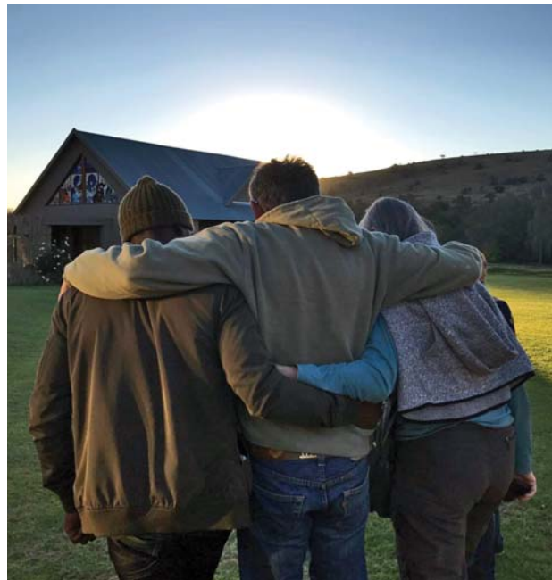
Here three lovely humans from three different countries and backgrounds hold each other up. While this picture is physical support, it is representative of the spiritual support we had for each other.

While in South Africa, I was not witness to the dependent and needy Africa, as portrayed in media; but rather, the strong, resilient, community-based Africa; the kind of community I want to be a part of. Different isn't dangerous. Different is beautiful and this trip was about celebrating our differences and discovering our similarities. There is an African word, "ubuntu" that roughly translates to "I am because we are." It embodies a community-based and empathetic worldview. We cannot continue to divide ourselves because of differences. We must recognize the beauty in one another and spend more time laughing together and celebrating each other.