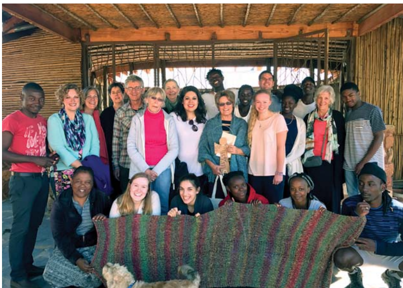
Our brothers and sisters will remain in our prayers, and we in theirs, despite distance. Thanks to our prayer shawl ministry, we were able to gift this symbol of our continued thoughts, prayers, and gratitude.