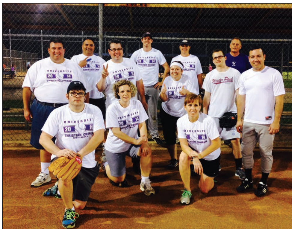
The UCC softball team is all smiles after a victory on the field!