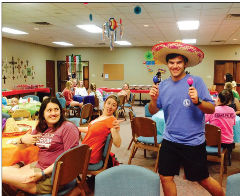
College students relax during finals week at Cinco de Finals Feast.