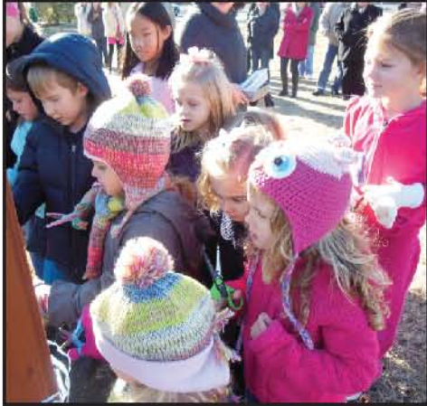
UCC Weekday School children cut the ribbon at the Growing Up Green Community Garden Ground Breaking Ceremony on Sunday, January 13.