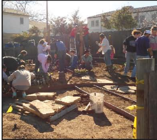
At the Garden Workday the following Saturday, Weekday School families, TCU students, UCC members and community gardeners work together to help bring about the garden