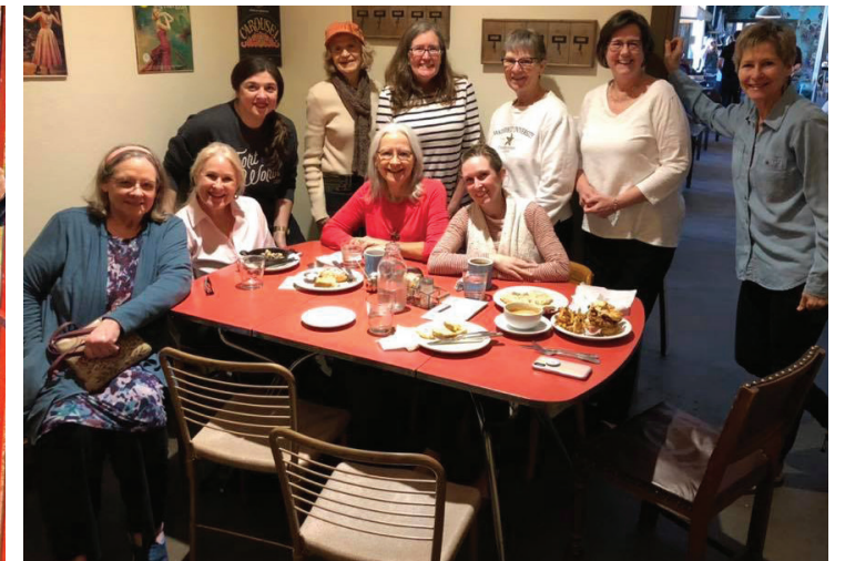
Photos of the Fat Tuesday Pancake Supper, Puerto Rico Mission Pilgrimage and Latte With the Ladies.