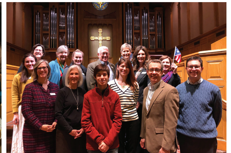
Photos of the Annual Fine Arts Show, Sunday School and Puerto Rico Commissioning.