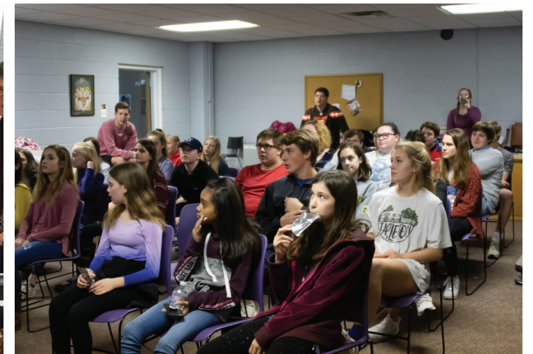
Photos from Just Say Know, Clergy Woman's Breakfast, Latte With the Ladies and Youth.