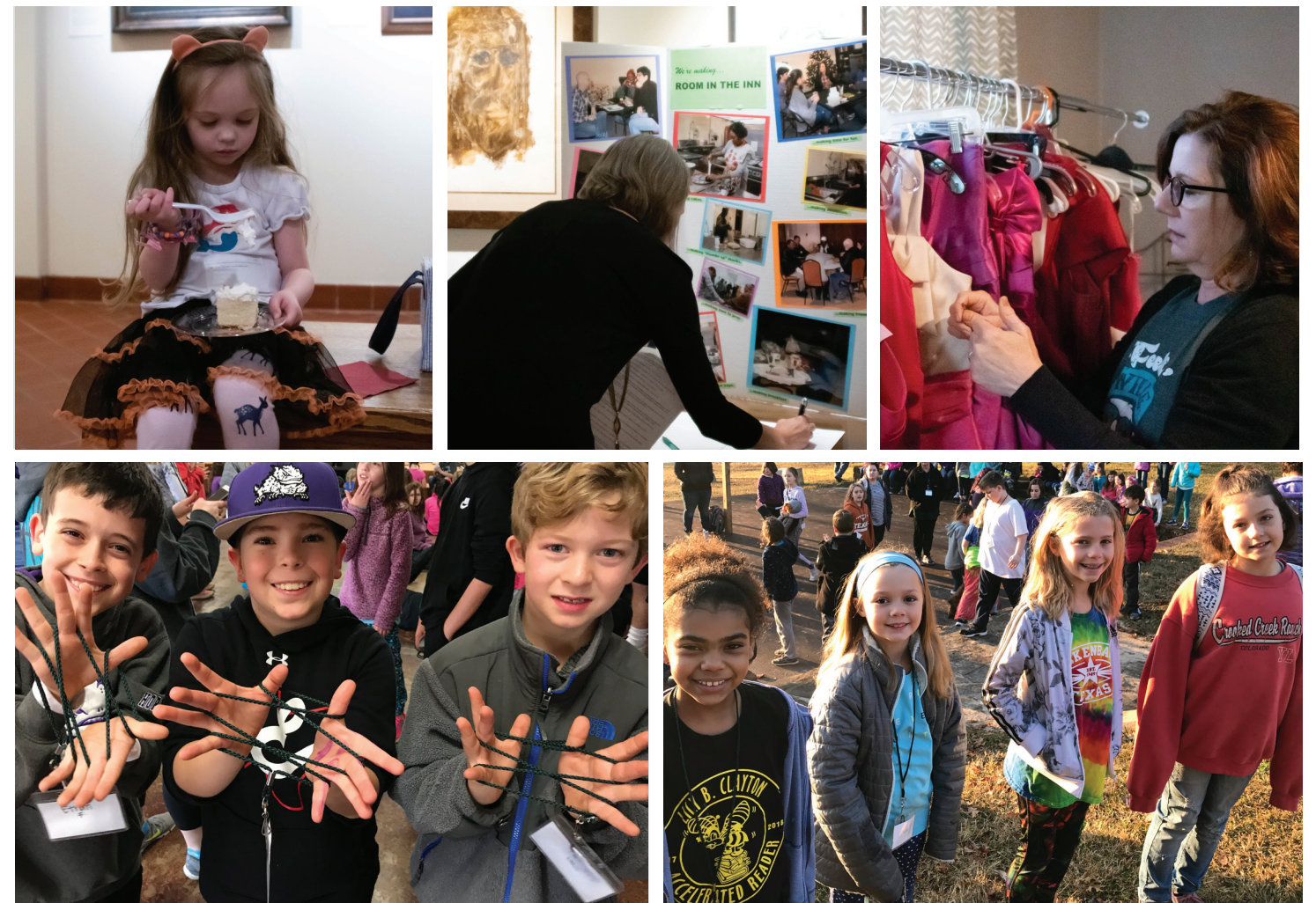
Photos from Room In The Inn Anniversary Reception, Prom Dreams Work Day and JYF Midwinter.

UNIVERSITY Christian Church Open minds, loving hearts