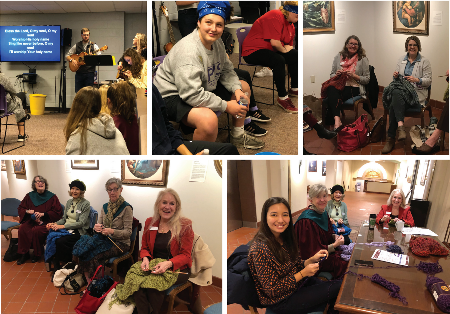
Photos from Youth Spring Kick-off and Knitting Prayers for Our New Year.