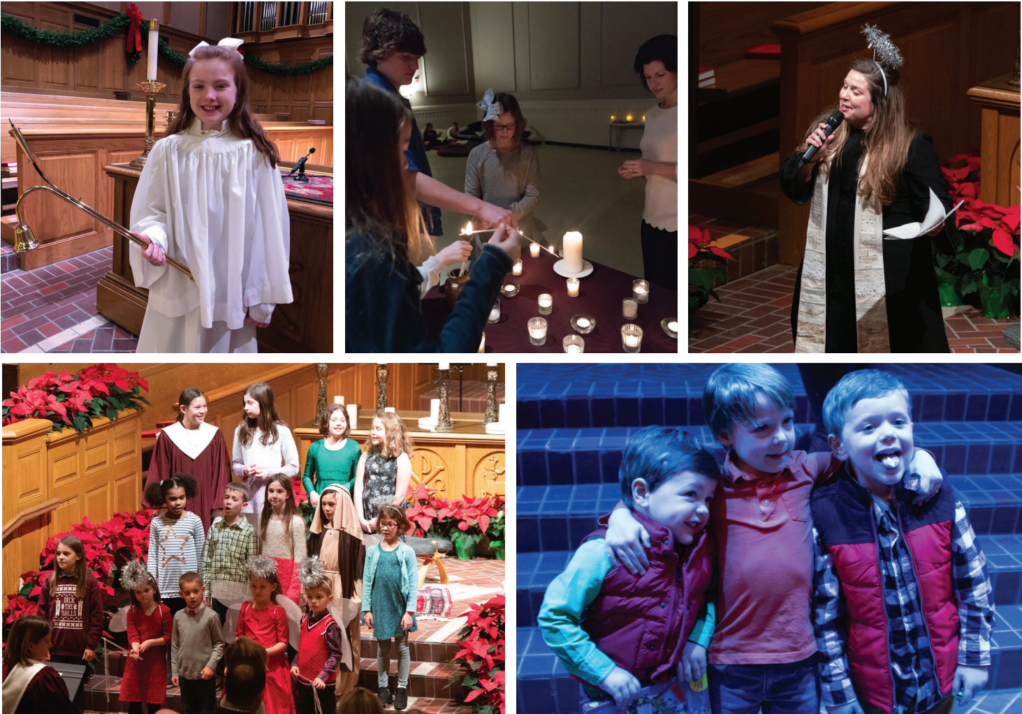
Photos from the Advent Season at UCC