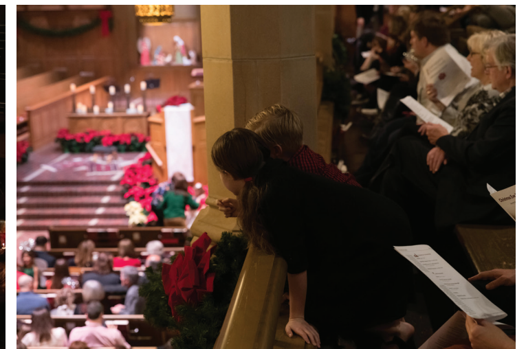
Photos of Advent at UCC