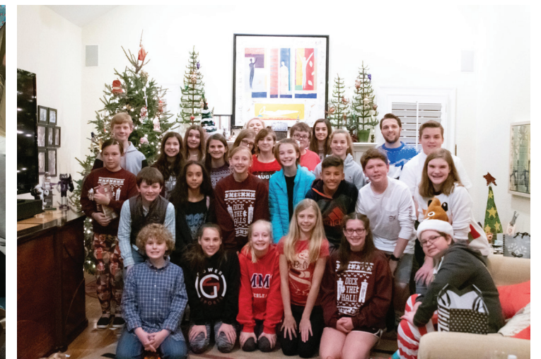
Photos of WDS Santa Visit, CYF Christmas Party, Gloria Composer, Finals Feast and Chi-Rho Christmas Party