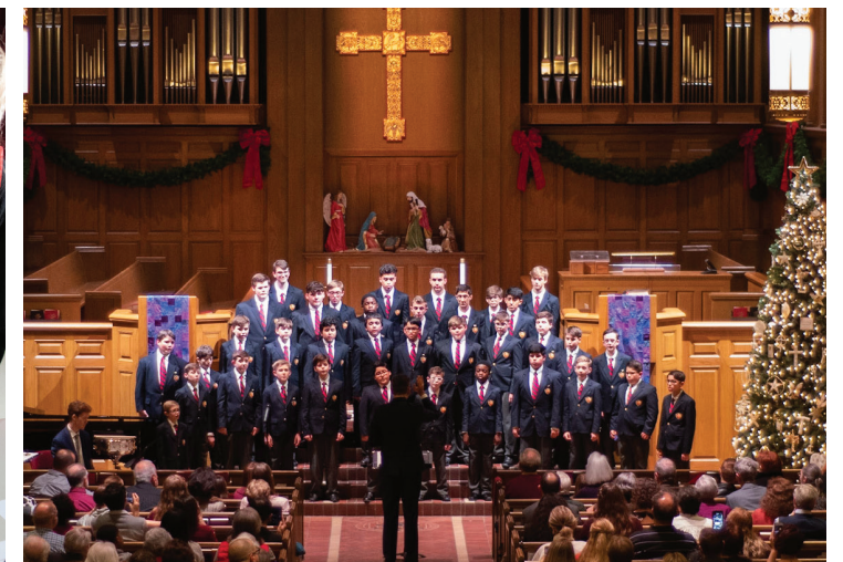
Photos of Women's Christmas Tea, Christmas Angels Wrap Night and Texas Boys Choir