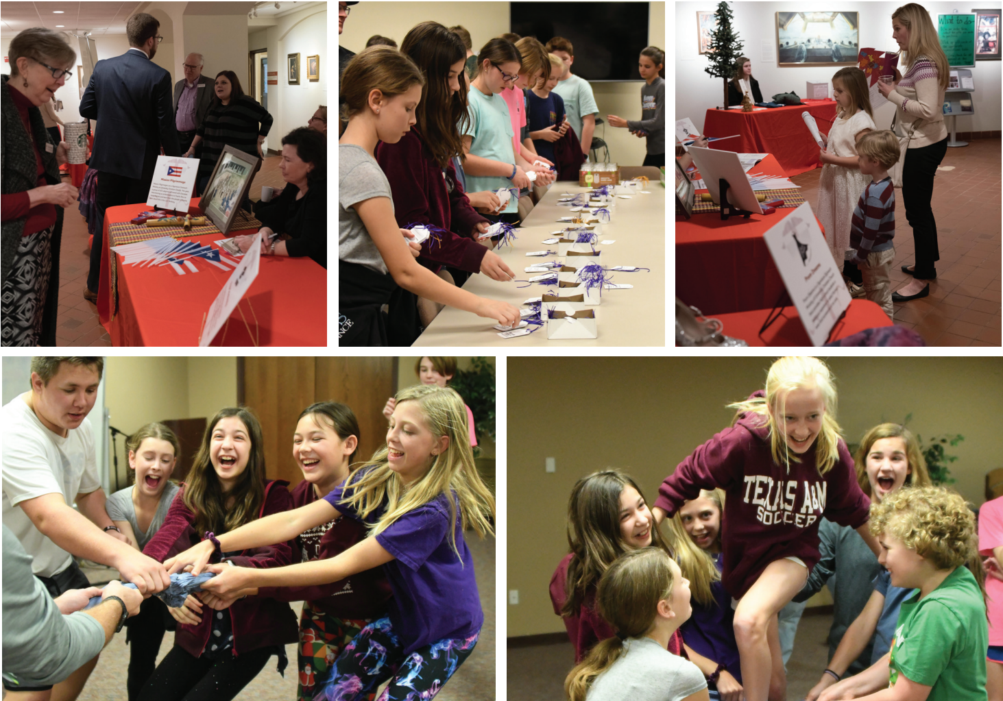
Photos of Youth Game Night and Gifts of Hope

Personnel Committee | Monday, December 10 • 5:30pm | RM 202 Finance Committee | Tuesday, December 11 • 5:30pm | RM 203