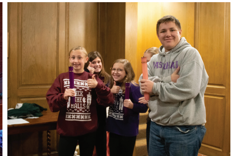
Photos of Hanging of The Greens Service