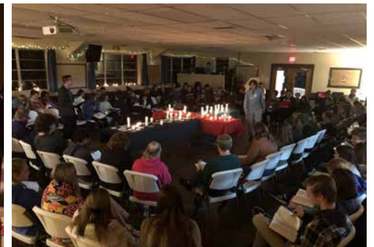
Photos of Higher Education Sunday, CYF Fall Retreat, and Youth Activity Night