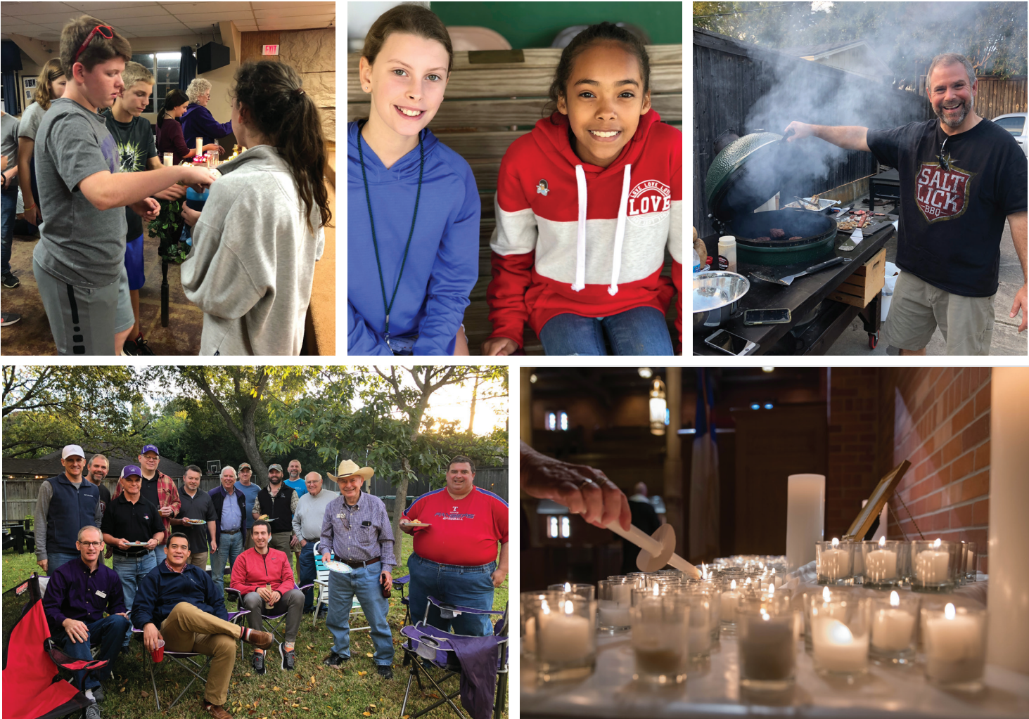
Photos of Chi Rho Retreat, Fire and Meat and All Saints Sunday