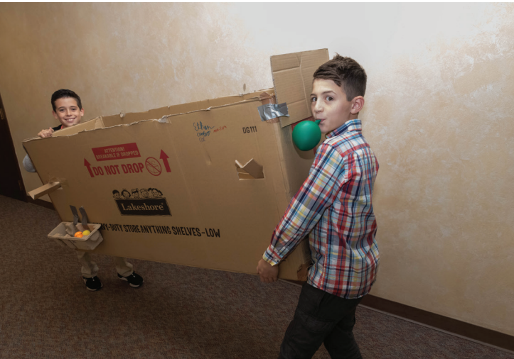
Photos of Gallery Rededication and Cardboard Arcade Set-up