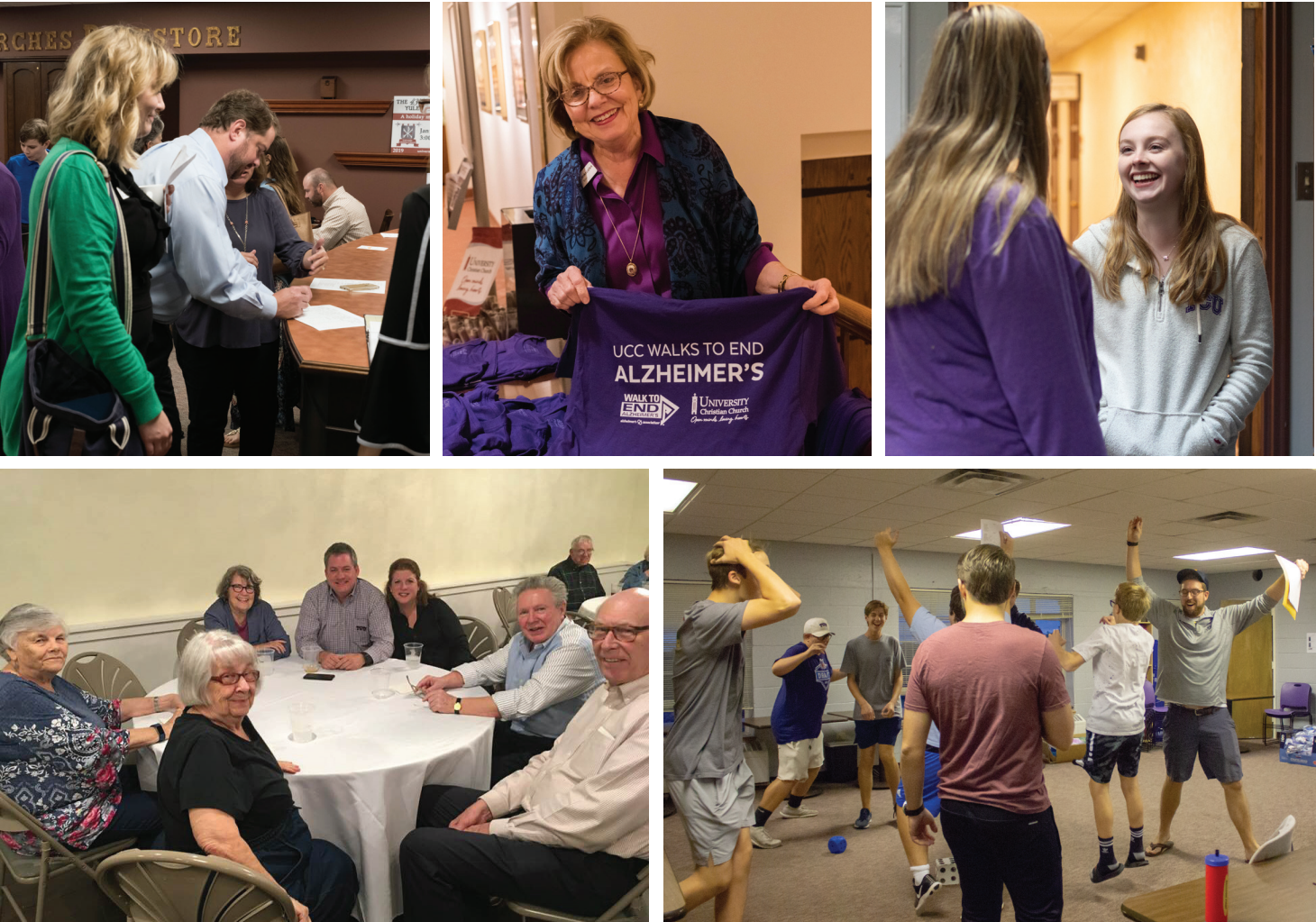
Photos of BHYLF Cast and Crew sign ups, Walk to End Alzheimer’s sign ups, Choir Retreat, Youth Game Night and College Lunch Bunch