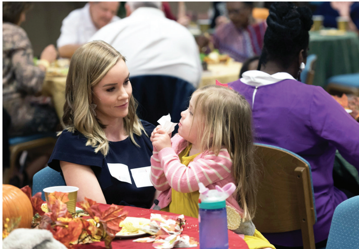
Photos of Faith Community Nurses and New Members Lunch