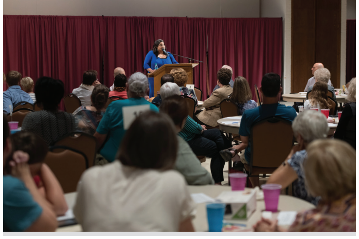
Photos from Women Who Make A Difference Lunch and Hearing & Healing: Table Conversation on Racism