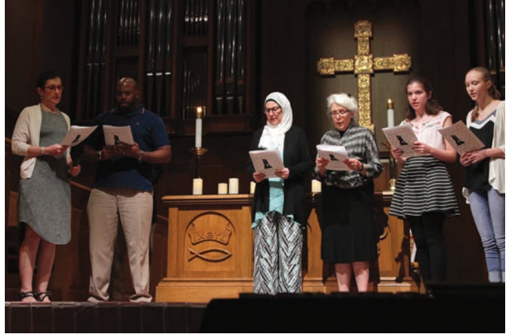
Photos are from #ucconthego, CYF Conference and Niners Camp at Disciples Crossing and Interfaith Prayer Service.