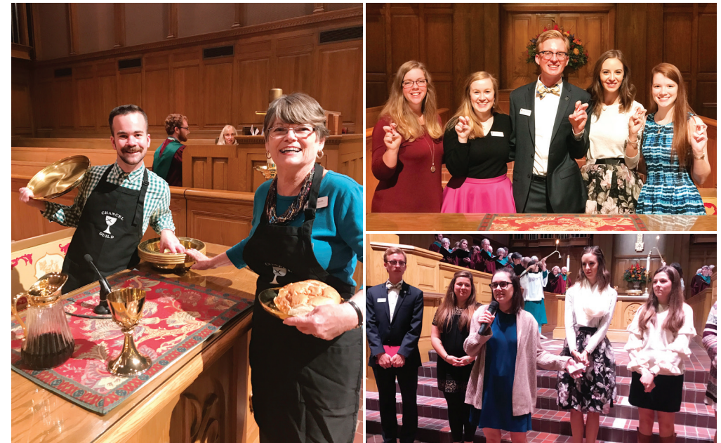
Photos from Higher Education Sunday where we celebrated the educational institutions that are an extension of the church. These learning communities are an extension of the church, challenging students to understand and respond to God's call to serve.