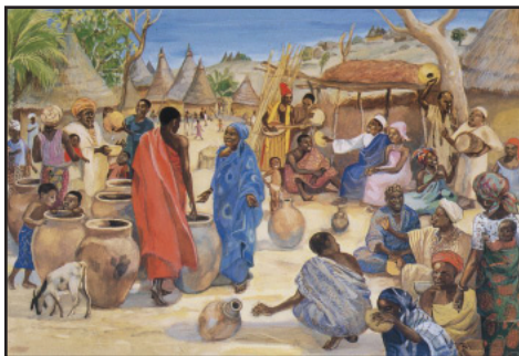
At Cana, Jesus Turns Water into Wine Jesus Mafa

Have you noticed the print of Jesus turning the water into wine? It is set in an African village in Cameroon, and even though it is relatively small, it stands out from the other offerings in The Gallery.