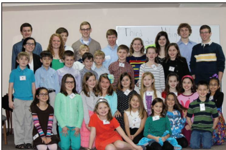
Sticky Faith in Action: Our High School Youth competed against the third graders in an intense version of Bible Bowl.

them to take on (and handily defeat) the High School juniors and seniors in an intense game of Bible Bowl. Thank you to all who helped to make our 2013 third Grade Bible experience a complete success!