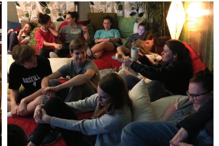
Photos from MLK Day of Service, Room In The Inn and 6th Grade Lock-In.

The flowers in the Chancel are given to the glory of God and in gratitude for all who share in UCC's Room in the Inn ministry as we celebrate its 10th anniversary.